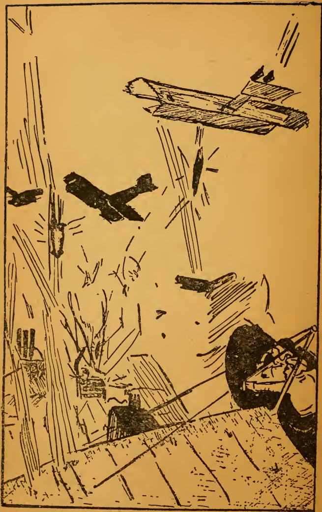
BLOWING UP THE GERMAN MUNITION FACTORY.